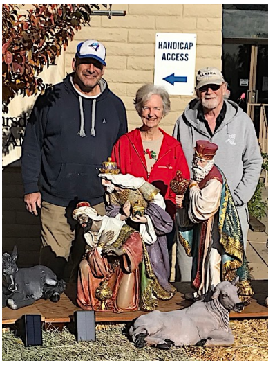
Yes, it's true, it takes some effort to transition from Thanksgiving to Advent/ Christmas. But it's also lots of fun!! Just take a look at the team at work.