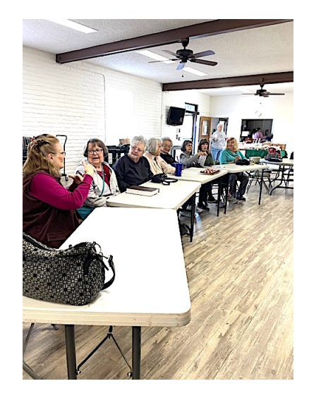
Last Monday morning a bus from Bruceville Point brought 9 residents for in-person Bible study. Several from Galt UMC were present for the study. The group is ready to meet again this coming week.