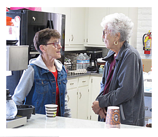
Twenty-six people attended the Study