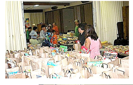
A Thursday morning Give-Away in 2015. You may notice some physical arrangement differences.