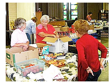
Some of our long time volunteers were around back then.