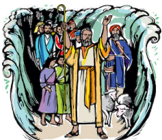
Moses Parts the Red Sea