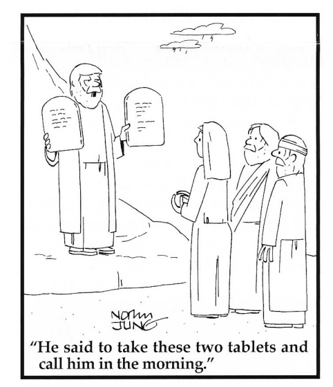
from JoyfulNoiseletter.com Reprinted with permission