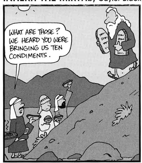
from JoyfulNoiseletter.com ©Cuyler Black Reprinted with permission