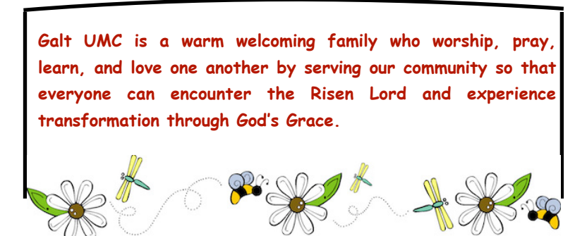
September 12, 2022